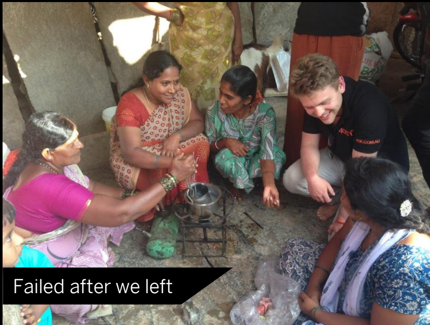
Candle Manufacturing For Employment