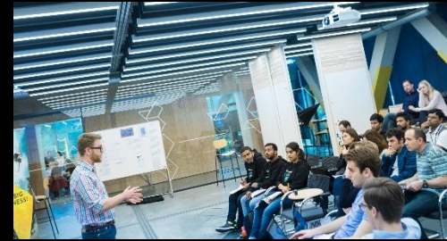
Pitch to Safe Audiences