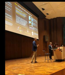
Work with Universities