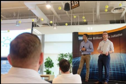
Select the Right Idea