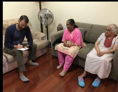
Test the Desirability