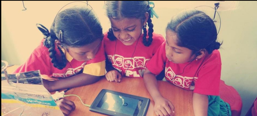
40K Plus – Aussie SME

Tabletised, peer-led education, where there are no qualified teachers