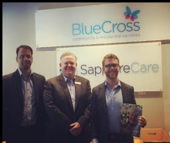
Test the Viability