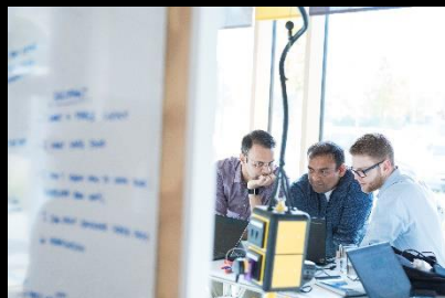
Research & Design the Business Model