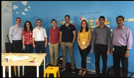
Recruit the Passionate