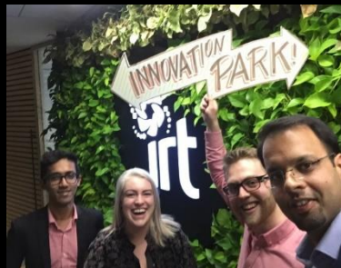
Test the Feasibility