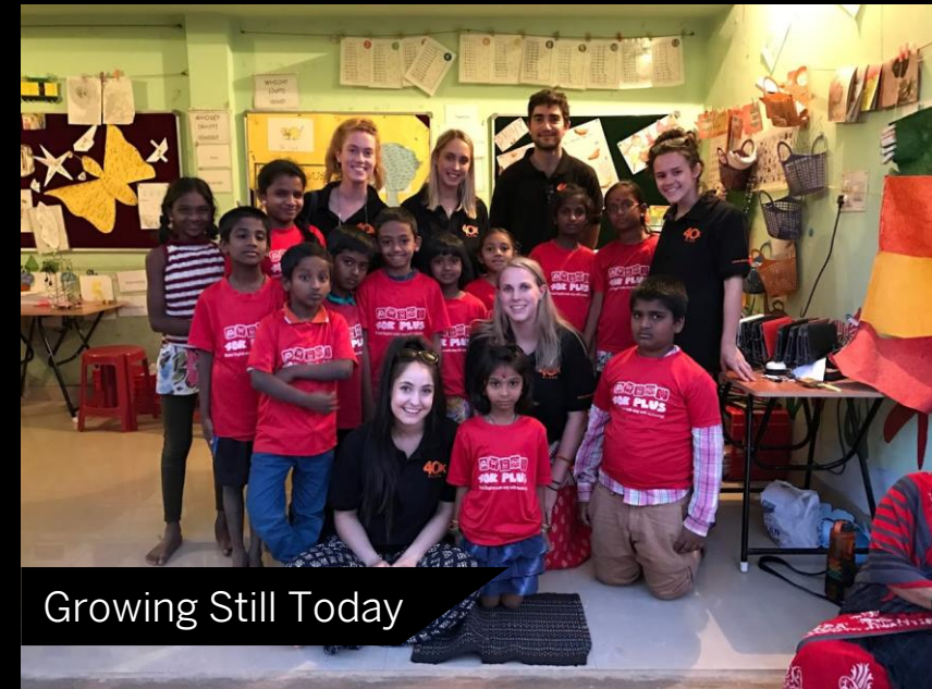
Village-led Plus Pods For Sustainable Education