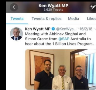
Work with the Government