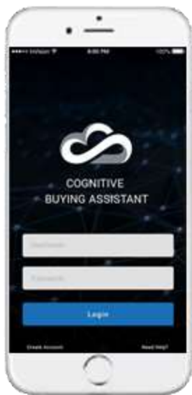
Cognitive Buying App