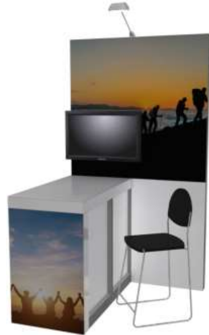
Pod rendering in group of three as installed in a 10'x20' space.