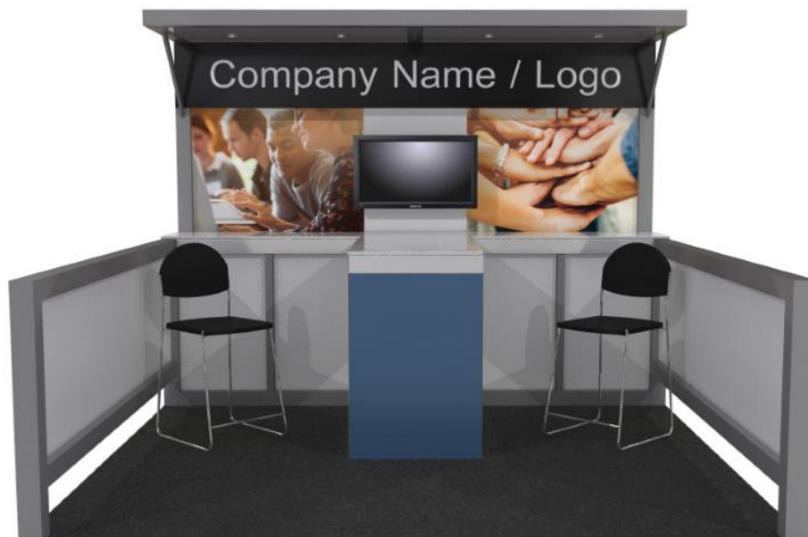
Silver booth rendering